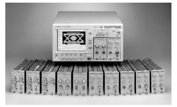
86100A with plug-in modules